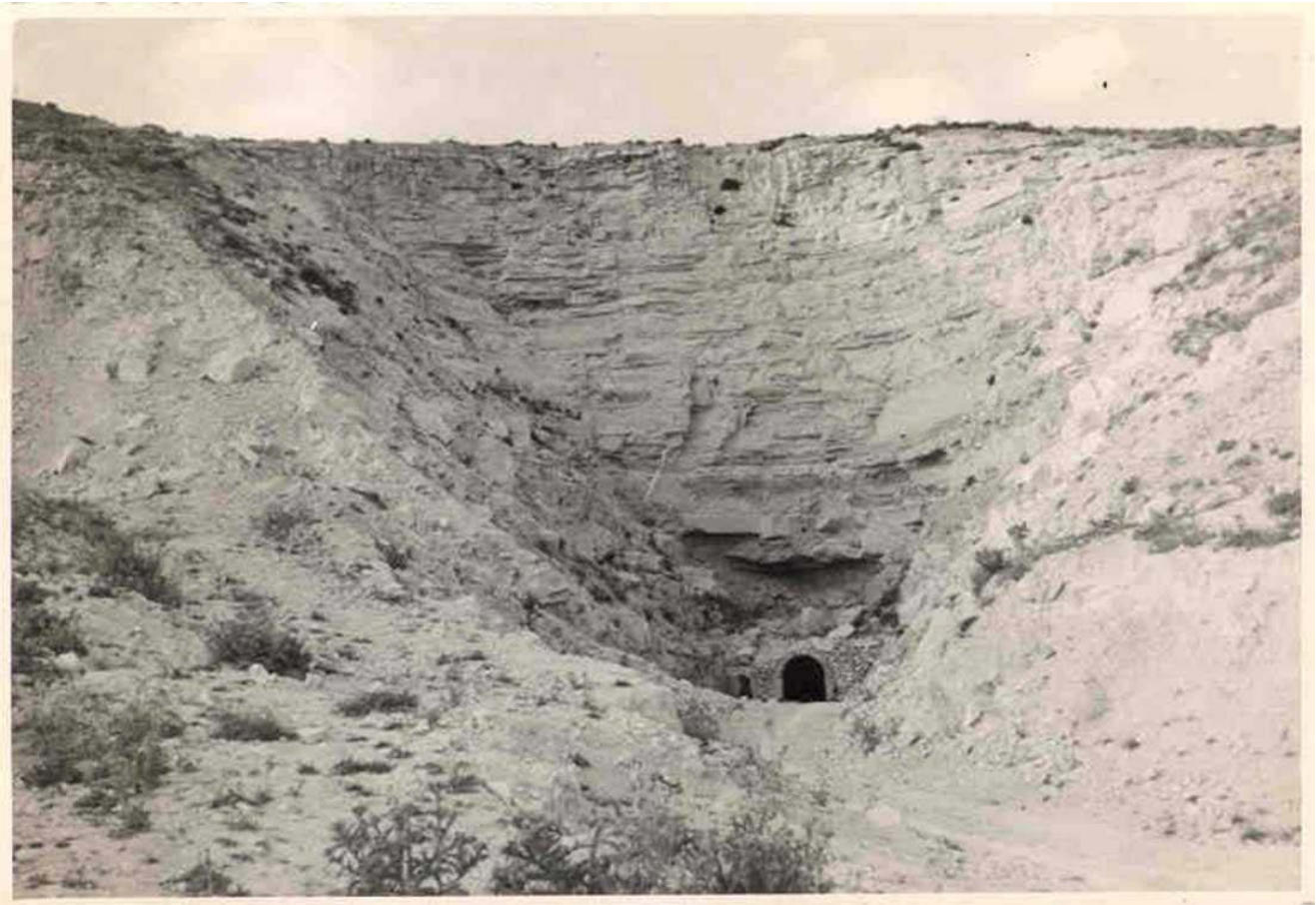
Figure 9 Showing the scale of the rock face above where Eric was working

The company that I worked for had an interest in scrap metal, and six of us were sent to see what could be re covered for scrap.