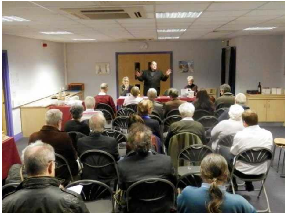
Figure 1 Our Chair in control at the AGM