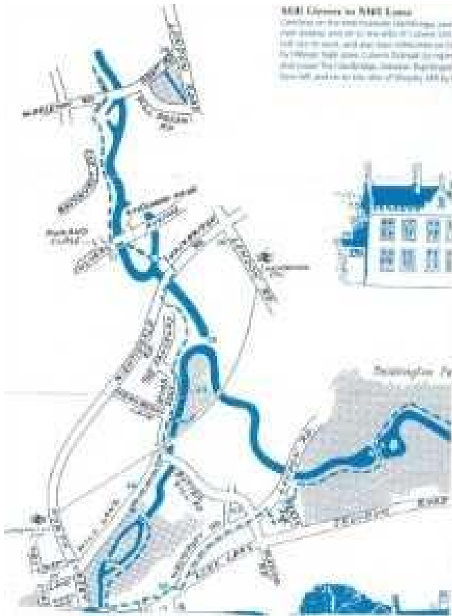
Figure 2 an extract from our original 1988 map

A suggestion, by Michael, that we may look at an App of our map before someone else does.