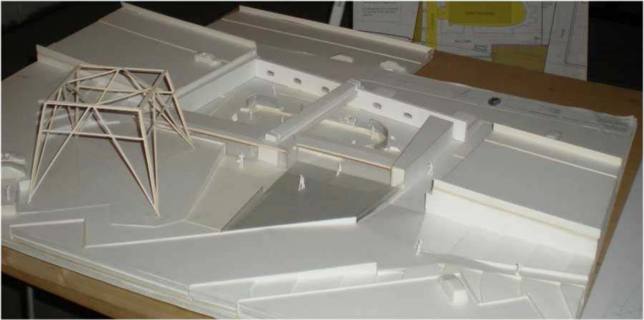
Figure 8 the Chapter House improvement model

There is every hope that, exactly 900 years since the monks from St Albans founded their new Priory in Merton in what is now Merton Park, the site they moved to 3 years later will have reopened to celebrate that historically important 400 years before Henry VIII's dissolution closed it forever.