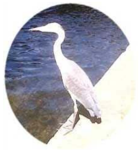
Figure 6 Henry the heron on first sighting