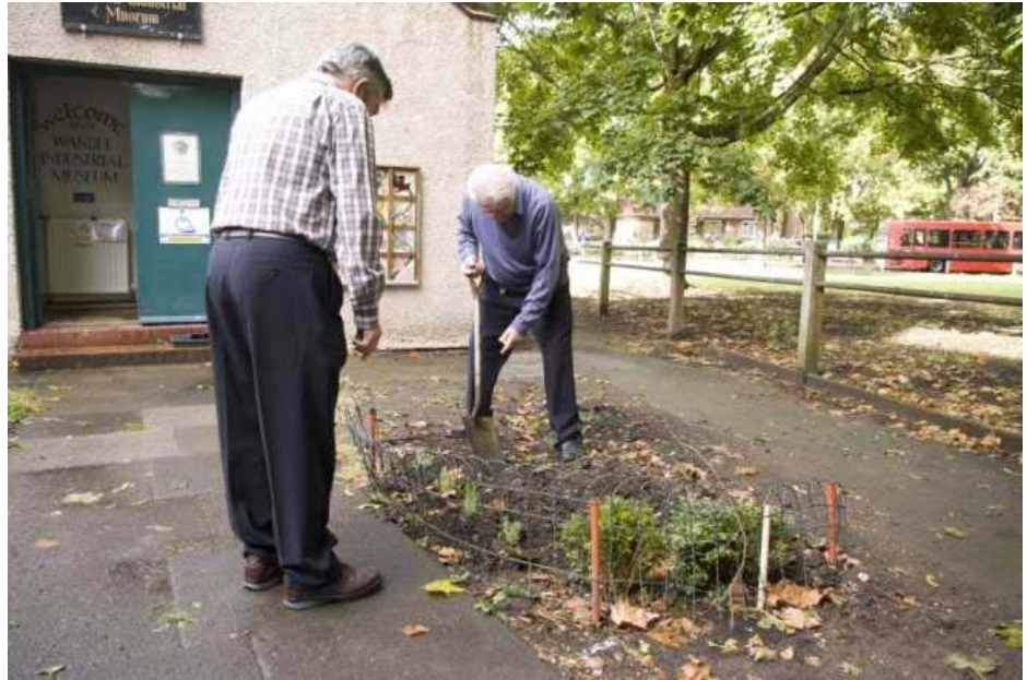
Figure 3 creating the 'garden'

Over the last few years the two areas either side of the path leading to the museum entrance has changed from