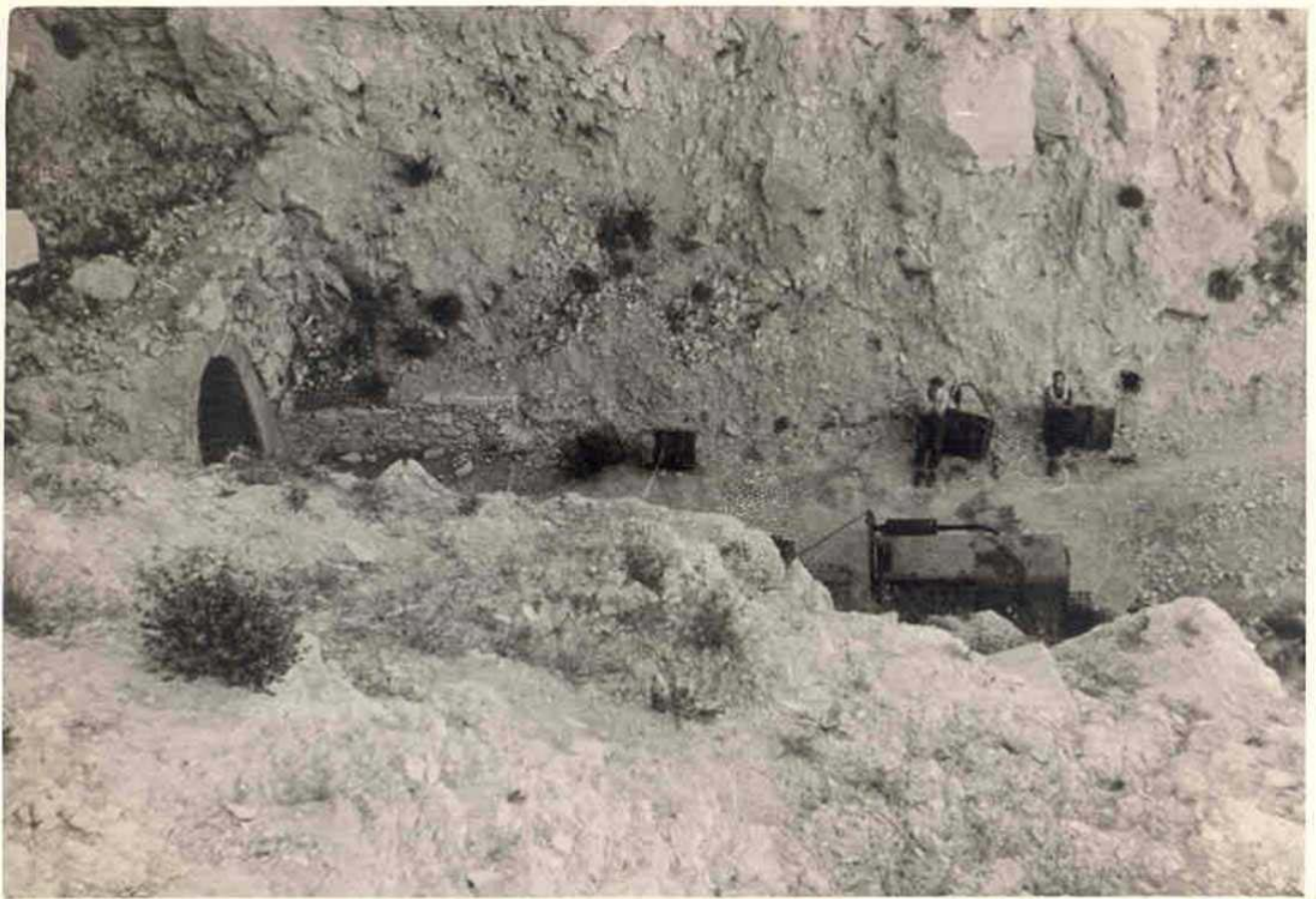
Figure 10 ... and how small the people by comparison

We had our own electric generator and air compressor for our pneumatic drills. We also took steel supports to hold up the rock that was shattered, to make it safe for us to continue digging. We worked around the exploded area and then into it to see what we could find.